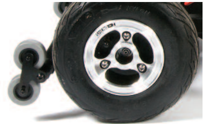
Quintell™ Kerbmaster™ Anti-tipping / Powered Anti-grounding