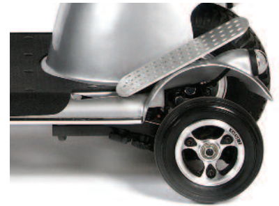
Quintell™ Adaptive Footplates Adjustable to match your measurements