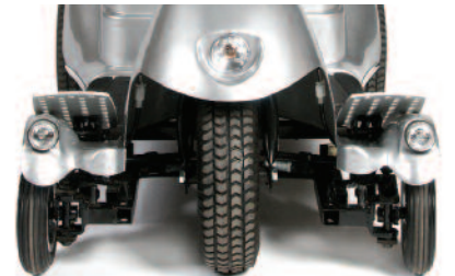
Quintell™ Self Centering Steering Defaults to straight travel with minimal effort