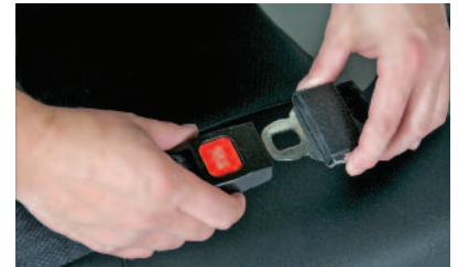
Quick release seat belt Adjustable to match your measurements